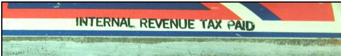
Stamped along the USBC 184-04 seam

Yes, Michigan collectors seem obsessed with those canning codes. For this case though, canning information can actually help us with our chronology. Lets take a closer look. Remember, USBC 184-05 has no IRTP information, and USBC 184-04 has the IRTP rubber-stamped along the seam: