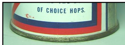
MBC 76-16.3 – Red CCC

Finally the RED CCC “52-A”, no patents info. This is the most “common” of the NSNG cones and definitely obtainable.