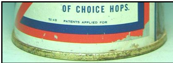
Older style "Patents Applied For"