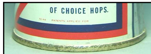
MBC 76-16.1 – Red patents info

First has the “52-4A” and patents information in RED . Likely the second NSNG chronologically but was photographed before the blue one.