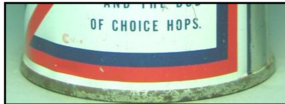
Newer CCC canning code

Both “THE NATURAL BREW”, USBC 184-04 and 184-05, as well as “NSNG” 184-02 come with the “PATENTS APPLIED FOR” canning info. Why would a non-IRTP beer can still carry information about patents? While I don’t know exact date Continental received patents for their canning technology, I am certain patents were granted prior to the 1950 IRTP requirement change.